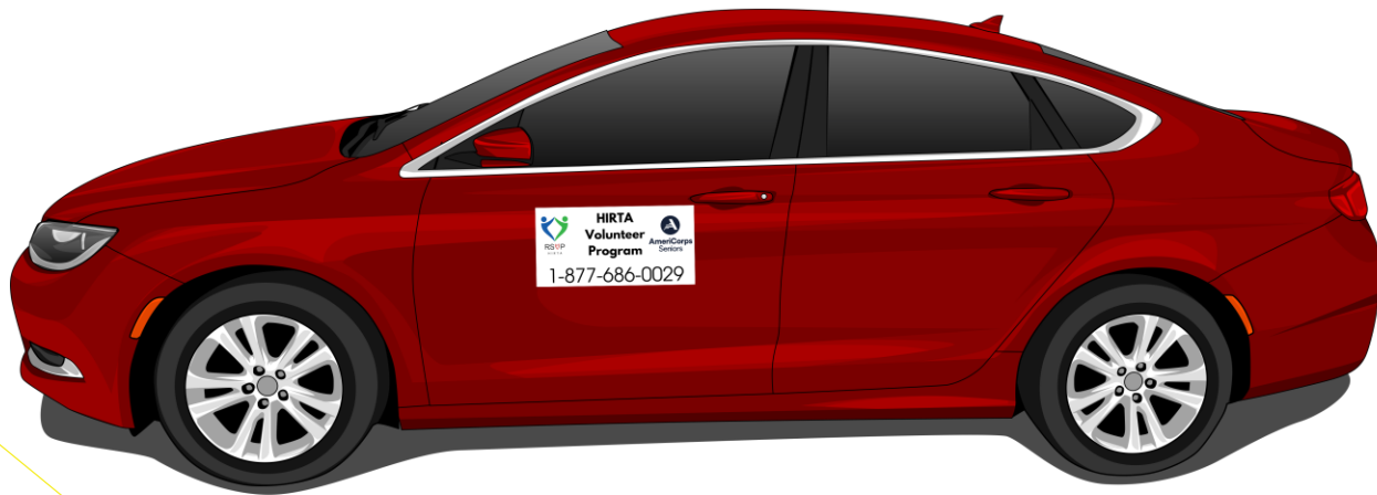
Social media graphic & cartoon car with HIRTA Helps magnet